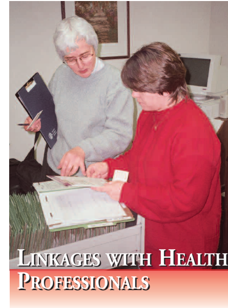
LINKAGES WITH HEALTH PROFESSIONALS

Child health and child care performance data identify common problems. Frequent communication with providers gives an informal mechanism for ongoing surveillance as well. Based on the data collected from self-assessment, surveys of providers and health professionals as well as requests for technical assistance, ECELS has targeted many areas for intervention. Some examples of these are: immunization, vision screening, oral health, obesity prevention, written health policies, active play safety, traffic safety, emergency preparedness, inclusion of children with special health care needs, and removal of hazards in child care settings.