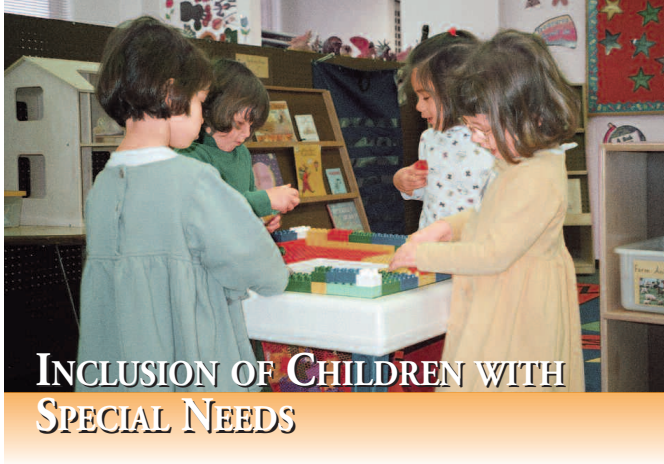
INCLUSION OF CHILDREN WITH SPECIAL NEEDS

With so many young children in child care facilities, control of injuries and infectious disease in these settings is crucial. Early childhood settings also offer many opportunities for health promotion.